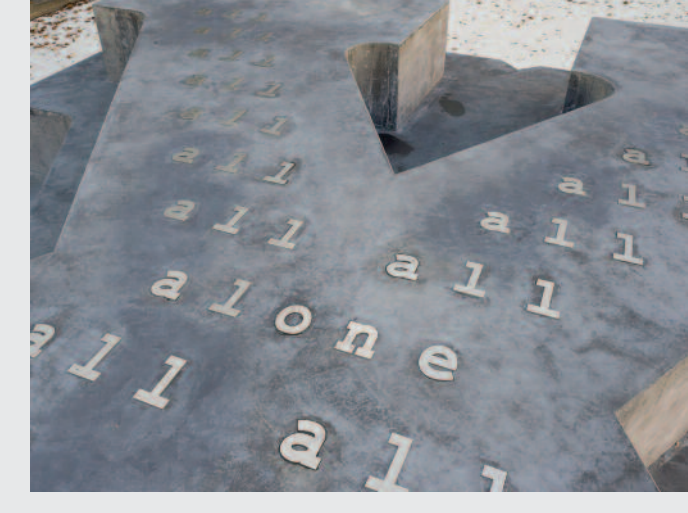
© Kunst im öffentlichen Raum GmbH. 2014

Information panel on the site of the former Wehrmachtuntersuchungsgefängnis (Wehrmacht remand prison) X in Vienna-Favoriten, unveiled on April 7, 2015; the municipal garrison headquarters in Universitätsstraße 7 were the seat of several Wehrmacht courts and convening authorities.